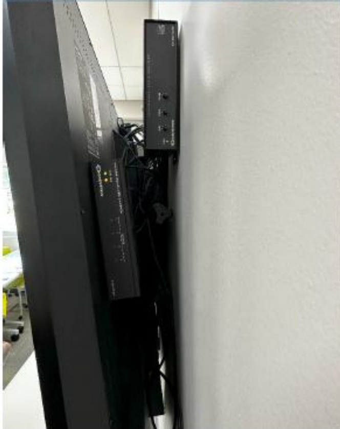
Training room 121 A- D: Display and peripherals