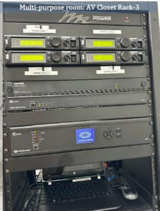
Multi-purpose room: AV Closet Rack-3