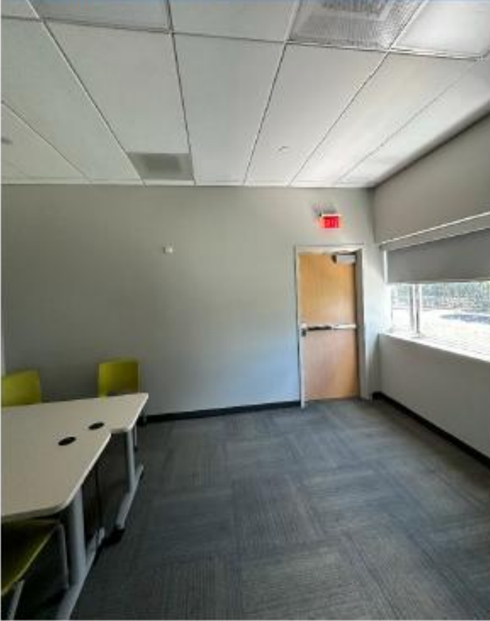
Training room 121 A- C: New Display location