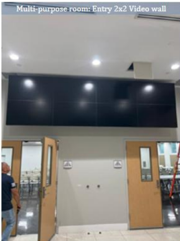
Multi-purpose room: Entry 2x2 Video wall