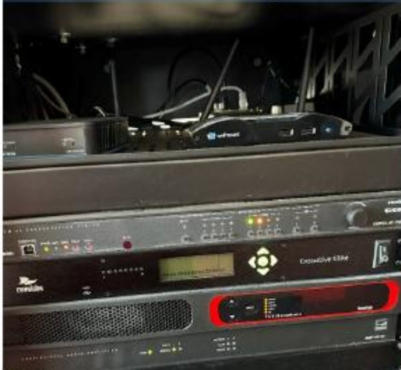
Board room 232: Existing rack 1