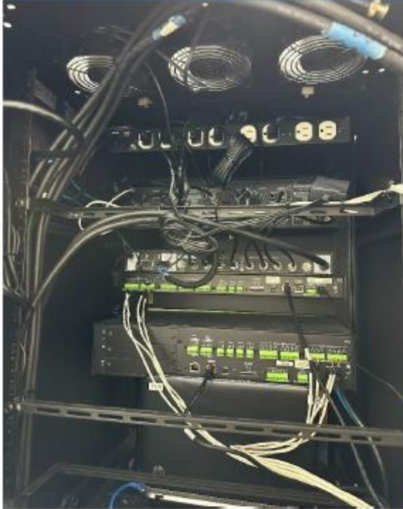
Multi-purpose room: Existing rack wiring 3