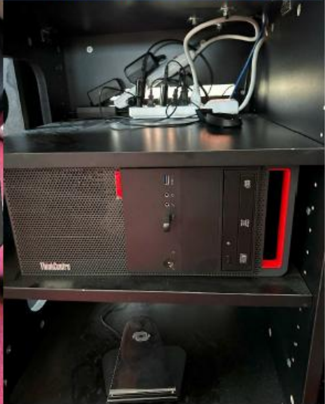
Board room 232: Existing rack PC