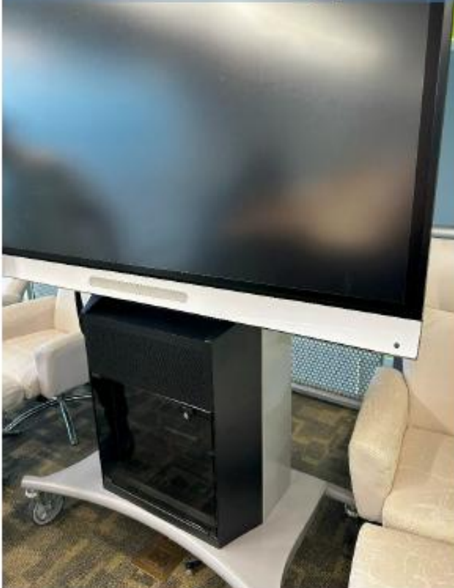
Presentation Cart: Existing system