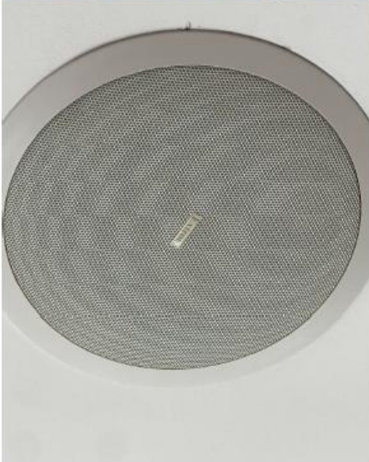
Training room 121 A- D: Ceiling speakers