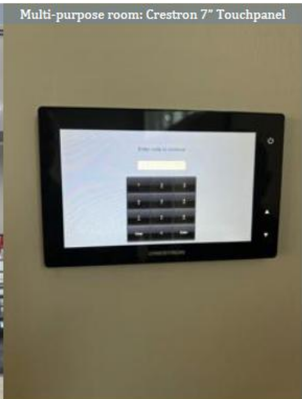
Multi-purpose room: Crestron 7" Touchpanel