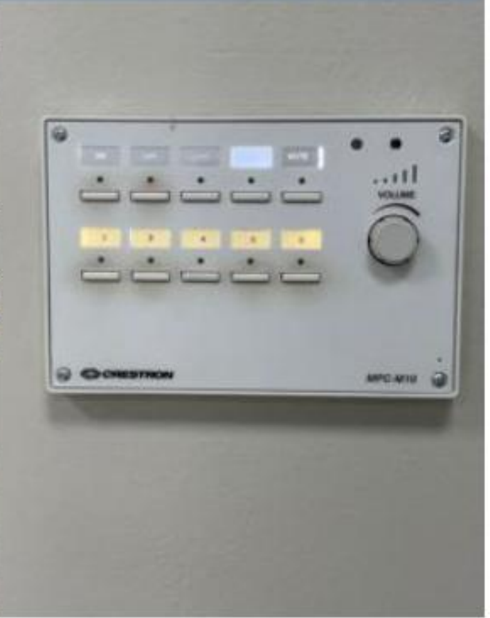
Training room 121 A- D: Existing control system