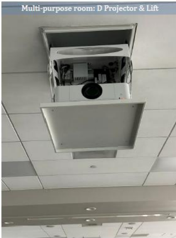
Multi-purpose room: D Projector & Lift