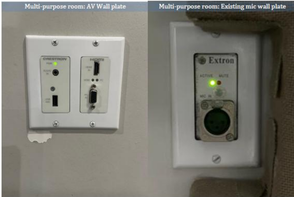
EXHIBIT B PROPE