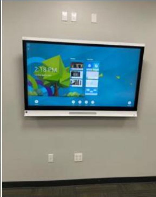
Training room 121 A- D: Existing Smart-board