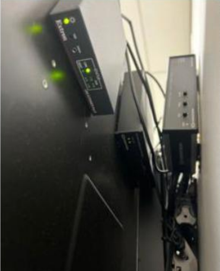
Training room 121 A- D: Display and peripherals