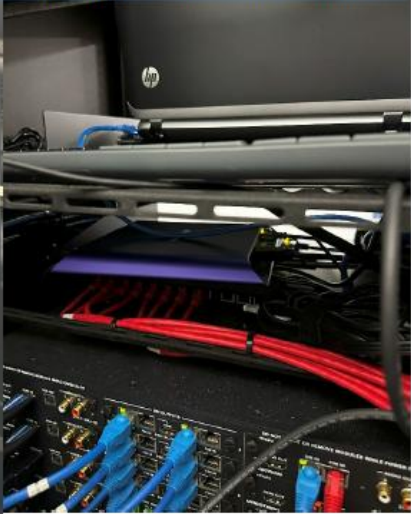
Multi-purpose room: Existing rack wiring 4