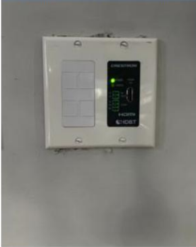
Training room 121 A- D: Video Wall-plate